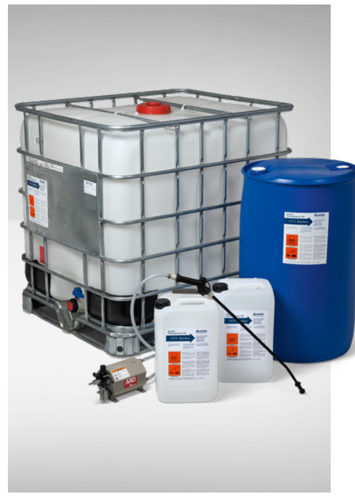
Avesta Pickling Spray 204 is a heavy-duty pickling spray.

To further improve the result we recommend passivating after pickling using Avesta FinishOne Passivator 630, which is a safer acid-free passivation method.